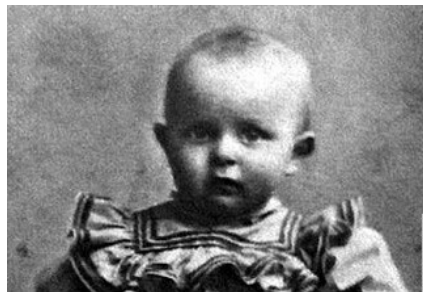
The Baptism of Karol Josef Wojtyla

On May 18, 1920, during the month traditionally dedicated to Mary the Mother of the Lord, one of her greatest treasures for the Church of her Son was born in the town of Wodowice, 35 miles southwest of Krakow Poland. The world would later receive him as Saint Pope John Paul II. His name was Karol (Polish for Karl or Charles) Josef Wojtyla. His hometown had about 10,000 residents, roughly 8,000 Catholics and 2,000 Jews. He was given a nickname by his friends, "Lolek."