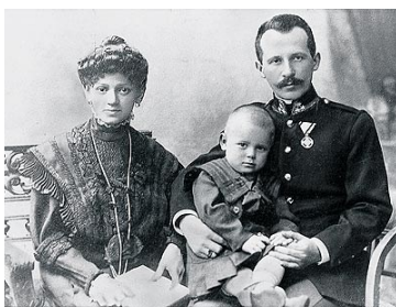
Karol Loses His Mother