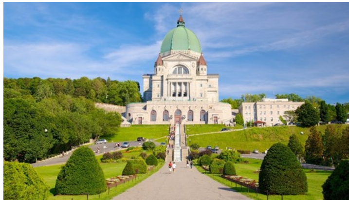
St. Joseph Oratory in Montreal

Several churches have also been named for Bessette, including ones in Ecorse, Michigan, [27] Laconia, New Hampshire, Portland, Oregon, Vaughan, Ontario, and Wilkes-Barre, Pennsylvania (now closed). There are also missions named for him in Cadiz, Philippines, Phoenix, Arizona, and York Region, Ontario